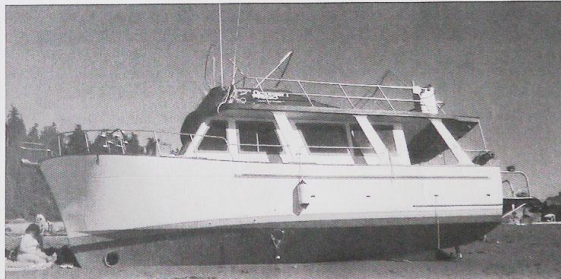
"Octo-Pussy" washed ashore demonstrating the importance of respecting both the sea and not mixing boats and swimmers anywhere, particularly at Wreck Beach.