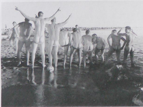
Liberation of Canada's Water Polo Team in training at UBC

GET THOSE WRECK BEACH PRESERVATION SOCIETY MEMBERSHIP CARDS NOW! THEY WILL GET YOU INTO NATURIST CLUBS ACROSS NORTH AMERICA AND EUROPE- WATCH FOR THEM AT THE WBPS TABLE. YOU GET THREE CARDS FOR THE PRICE OF ONE INCLUDING A GAWKER CARD YOU CAN HAND TO SOMEONE WHO IS NOT OBSERVING ACCEPTABLE BEACH BEHAVIOUR. FOR THOSE FOLKS, WE HAVE GAWKER CARDS WHICH COME WITH YOUR MEMBERSHIP CARDS FOR DONATIONS OF ANYWHERE FROM $2 TO $1-MILLION!