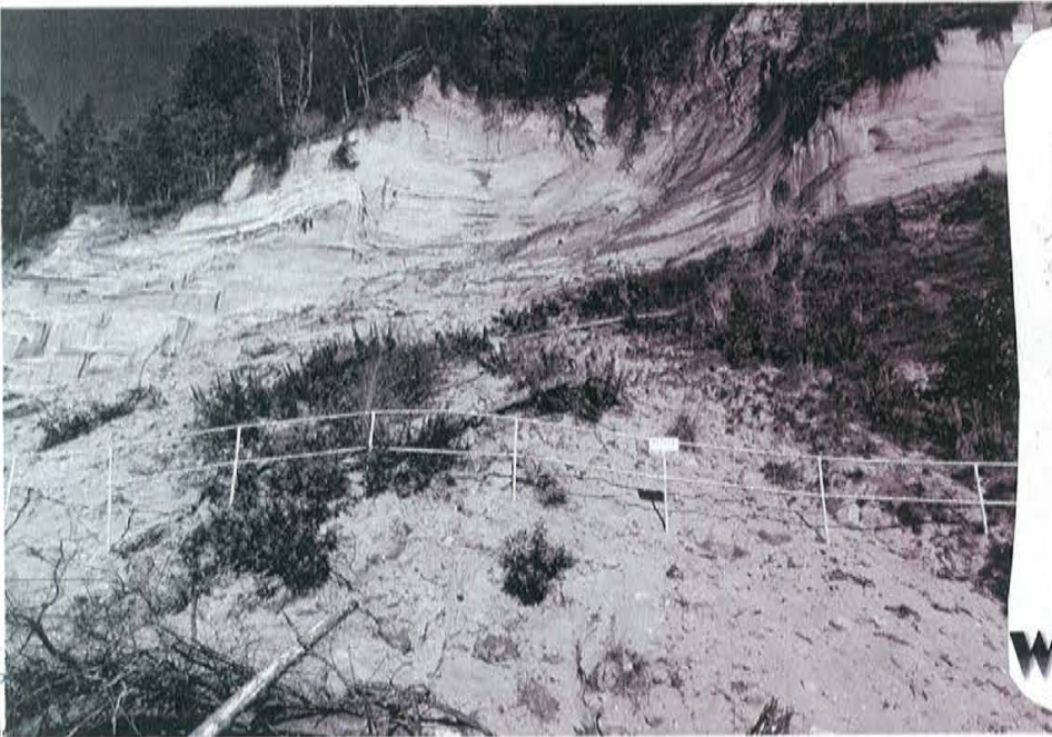
Photo of Point Grey Scar Cliffs Fencing and signage after the death of a young camper when the cliff failed this past year.

SKINNYDIPPER PHOTO OF 2015 & ASSORTED SHIRTS NOW AVAILABLE AT WATERMELON'S LICORICE SHOP ON COMMERCIAL