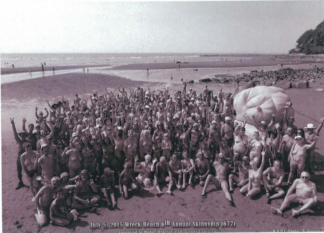
July 5, 2015 Wreck Beach 6 th Annual Skinnydip (677)