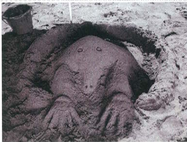
"Mole King" won best youth sandcastle trophy!

* There are no nude parks or beaches in Alaska.